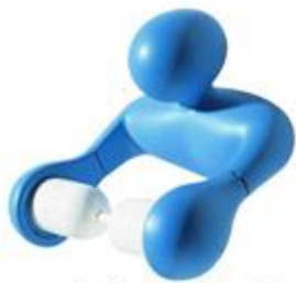
Toilet roll holder