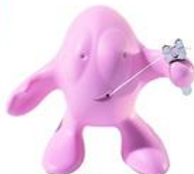
Dental floss holder