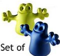
Set of bottle caps