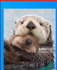
Snuggling sea otters

A lovely calm thing to look at to relax you.